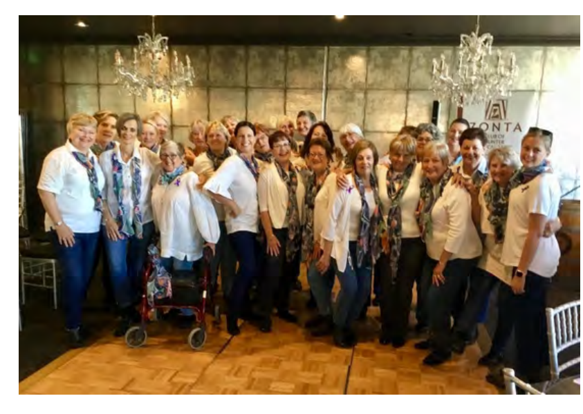
Above: Hunter Women of Note Chorus