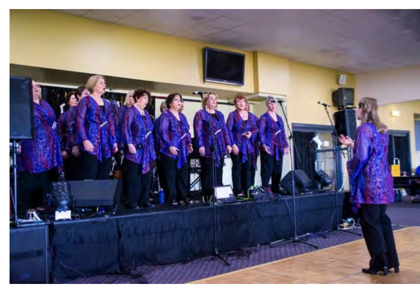
Above: Festival of the Voices, Merimbula 2017

We love singing for our community. We love meeting our friends at conventions and workshops. We love our chorus.