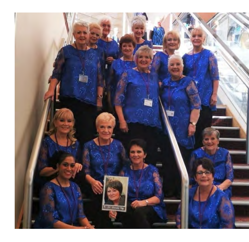
Above: Tasman Steps, Wrest Point, Hobart May 2019

Our chorus has a clear direction for growth with greater support for individual members. Our aim is to give each member training and support to reach her full potential. We stand as a united and strong group of women as we face the next decade of our journey.