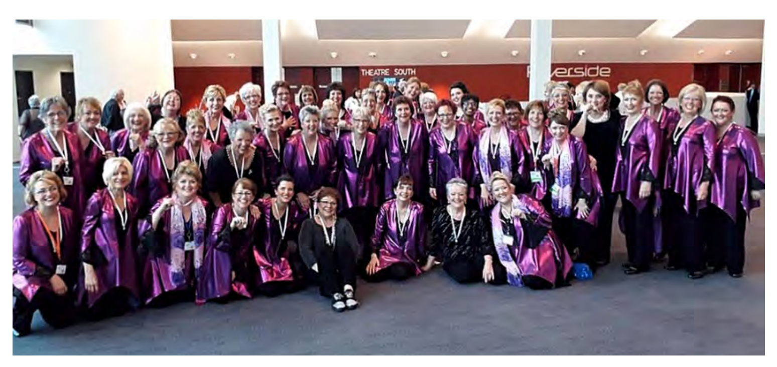
Above: Celebrating our 3rd place mid-sized chorus medal in the Sweet Adelines Australia 2017 Convention at the Perth Convention Centre

Where to from here? 2020 will see Indian Blue embark on yet another new opportunity, competing in the Open Division at the Sweet Adelines Australia convention in Hobart! We can't wait to share our package with the Region and continue to look forward to many more wonderful opportunities in the years to come!