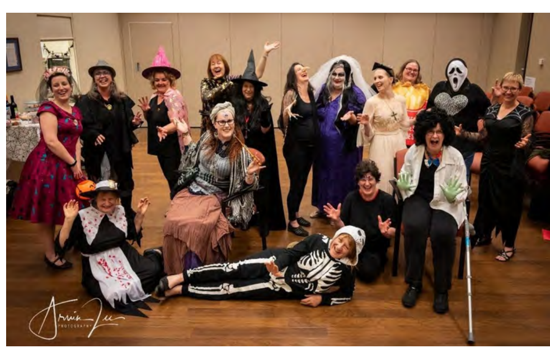
Above: Canberra Harmony celebrating Halloween 2018