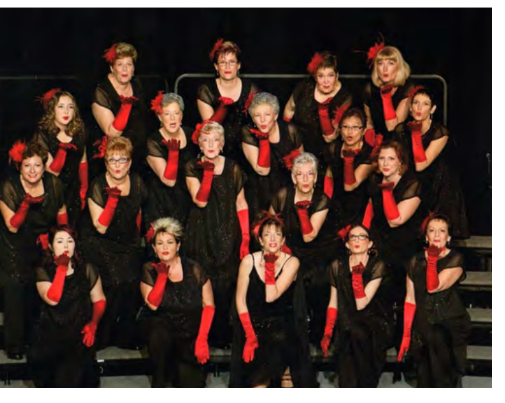
Above: SeaBelles, 2014 Sydney Convention