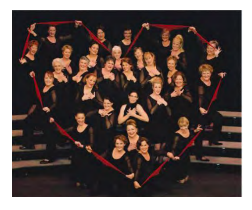
Above: Putting our hearts into our performance in Newcastle 2011