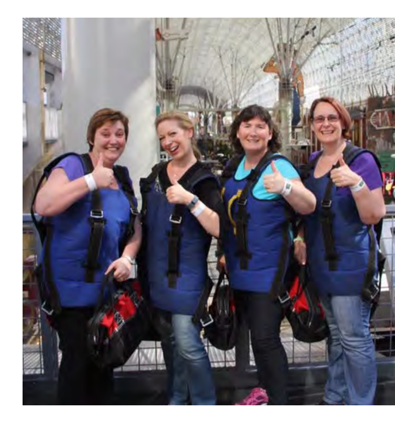
Above: Ready if you are! Ziplining in Las Vegas