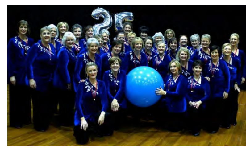
Above: BPC at the 2014 Sydney Convention

Thirty-three chorus members (including three dual members from Murrumbidgee Magic) took to the stage at the MGM Grand on 7 October 2015 in the first session of the International Convention, and in the first year of the new Harmony Classic format. We brought home a fifth-place medal, making us the first Australian chorus to have two international medals.