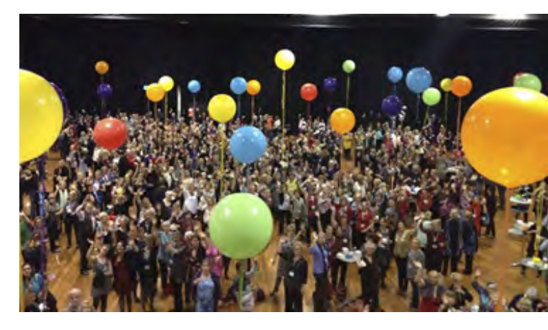
Above: Party time! 2014 Sydney Convention