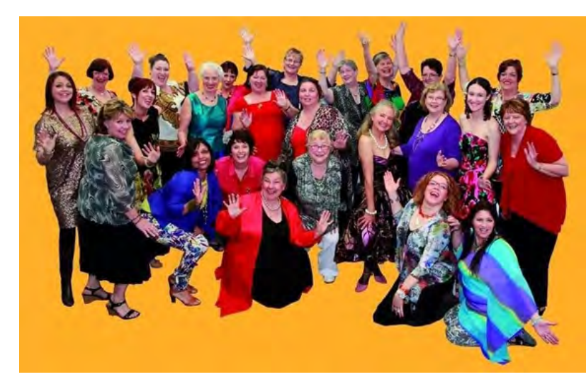
Above: Perfect Pitch Show 2013