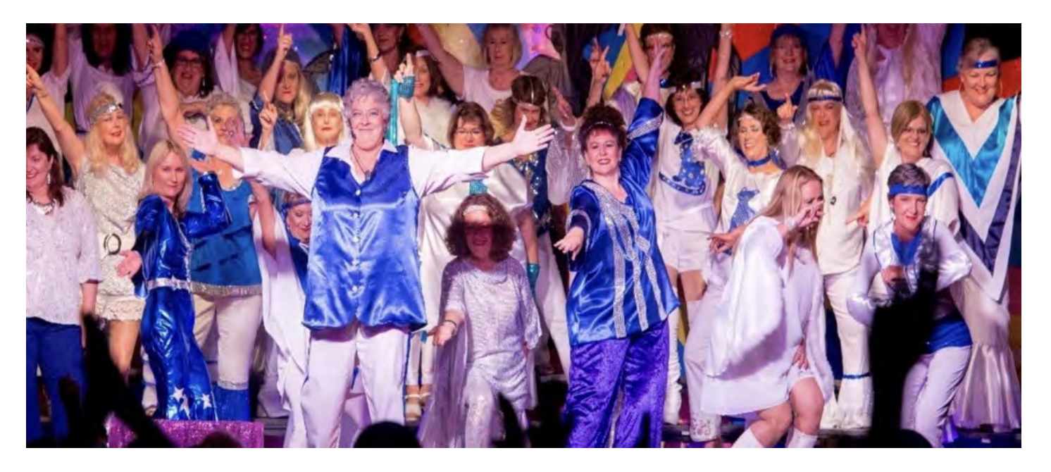
Above: In the mood for a dance in our colourful ABBA costumes

Headliners Chorus proudly continues to give to the community, performing when and where they can possibly impact an audience, big or small, with their joy of singing.