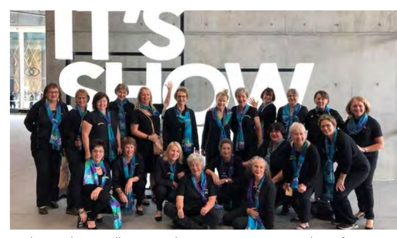
Above: The Headliners, Kindergarten Union National Conference, Sydney Convention Centre

High Altitude Harmony, a Toowoomba-based male barbershop chorus, joined the Headliners Chorus in 2017 in a heavily-promoted "Battle of the Barbershop" event hosted by Robert Channon Winery in Stanthorpe. The premise of "men originated barbershop harmony... women perfected it!" provided much laughter and entertainment throughout an afternoon of song. The audience vote was 50/50 leaving both groups happy to continue the challenge in the future.