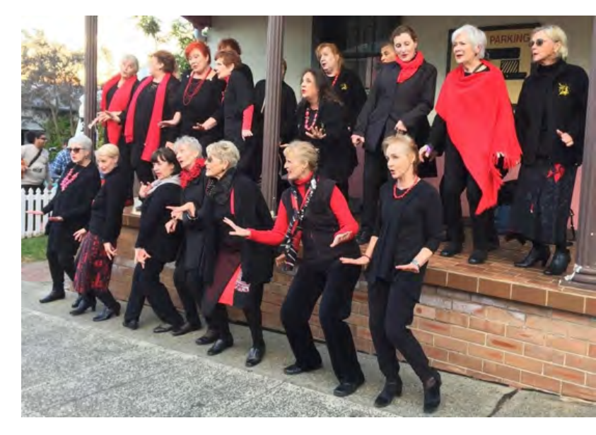
Above: Shellharbour Music Festival June 2019

We're looking forward to seeing what the next 10 years brings!