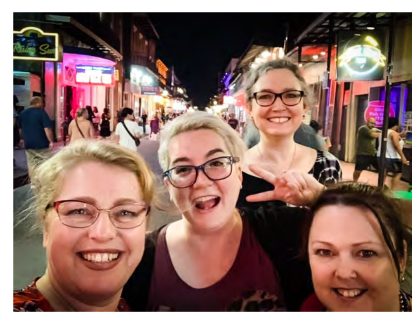
Above: Debacle in Bourbon Street New Orleans