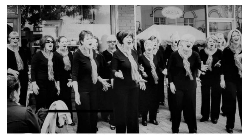
Above: 2009 Mornington Festival

Performances included the Frankston Waterfront Festival, the Mornington Peninsula Choral Festival and the Eisteddfod by the Bay at Mordialloc.