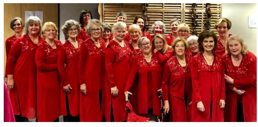
Above: Hunter Women of Note Chorus performance-ready at their annual show in 2019