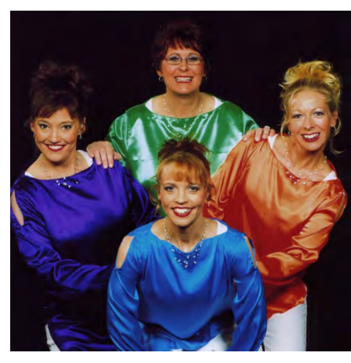
Above: First competition - and those white jeans!

We scored a very respectable 1118 for first time out, and yes, made sure our costumes were wrinkle-free!