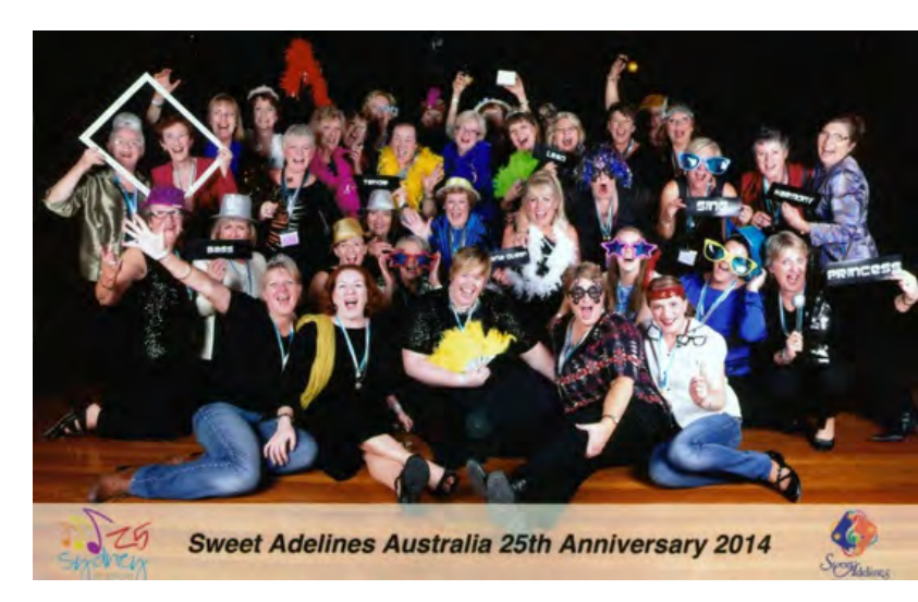
Above: Sydney Convention 2014