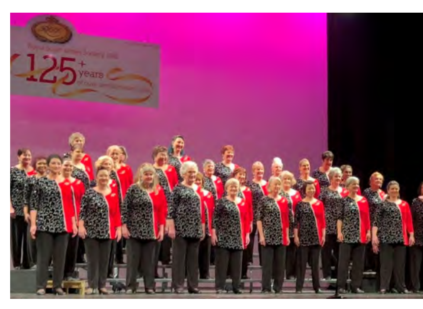
Above: Melbourne Chorus at the Royal South Street Eisteddfod, Ballarat - 2018