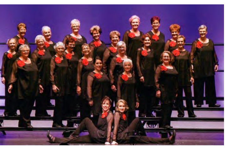
Above: A Cappella Bay Singers, 2019 Hobart Convention

Once upon a time, there were two Sweet Adelines choruses in a small regional town in Queensland - Seabelles and Soundwaves A Cappella. Although estranged, they were somewhat related.