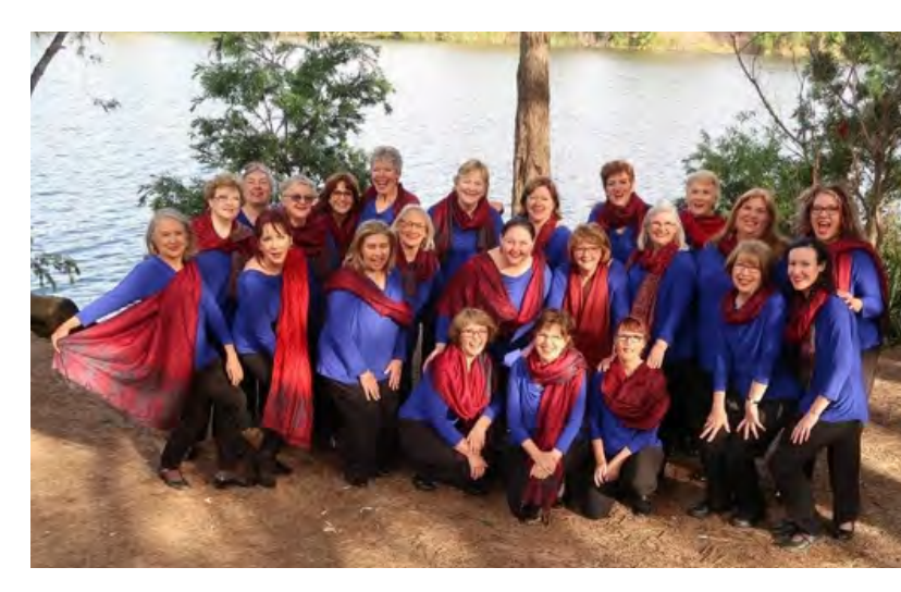
Above: 'I Am Woman' video project by the Nepean River