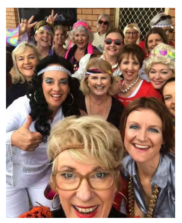
Above: Our trip to Trundle for the Abba Festival in 2017

Closer to home, we continue to be heavily involved in our local community – performing at citizenship ceremonies, the farmers markets, open gardens and at local aged care facilities. We have been a feature performer at the Bathurst Winter Festival and travelled to Wellington to perform for the Quota Art Festival. In 2017 we put on our best ABBA outfits and travelled by coach to Trundle to be guest performers at the annual ABBA Festival.