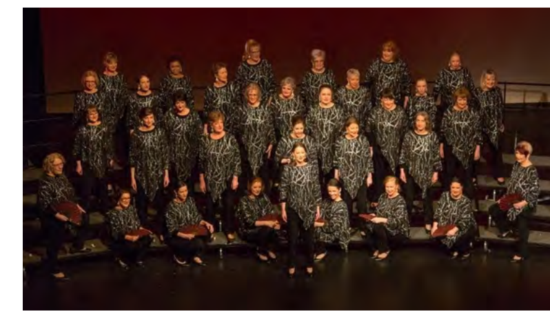
Above: Barbershop Harmony Society Contest 2019