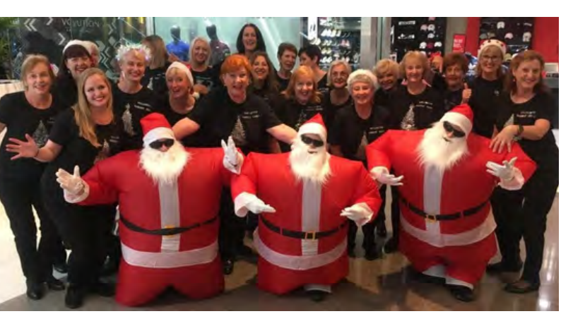
Above: Christmas at Westfield Miranda 2018