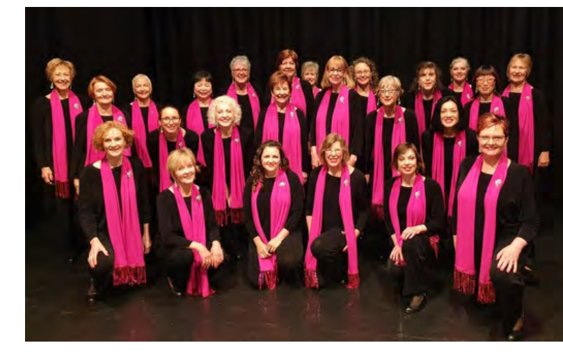
Above: ASC at the 2019 Barbershop Harmony Australia Convention in Adelaide

In 2016, ASC celebrated 25 years' membership of Sweet Adelines.