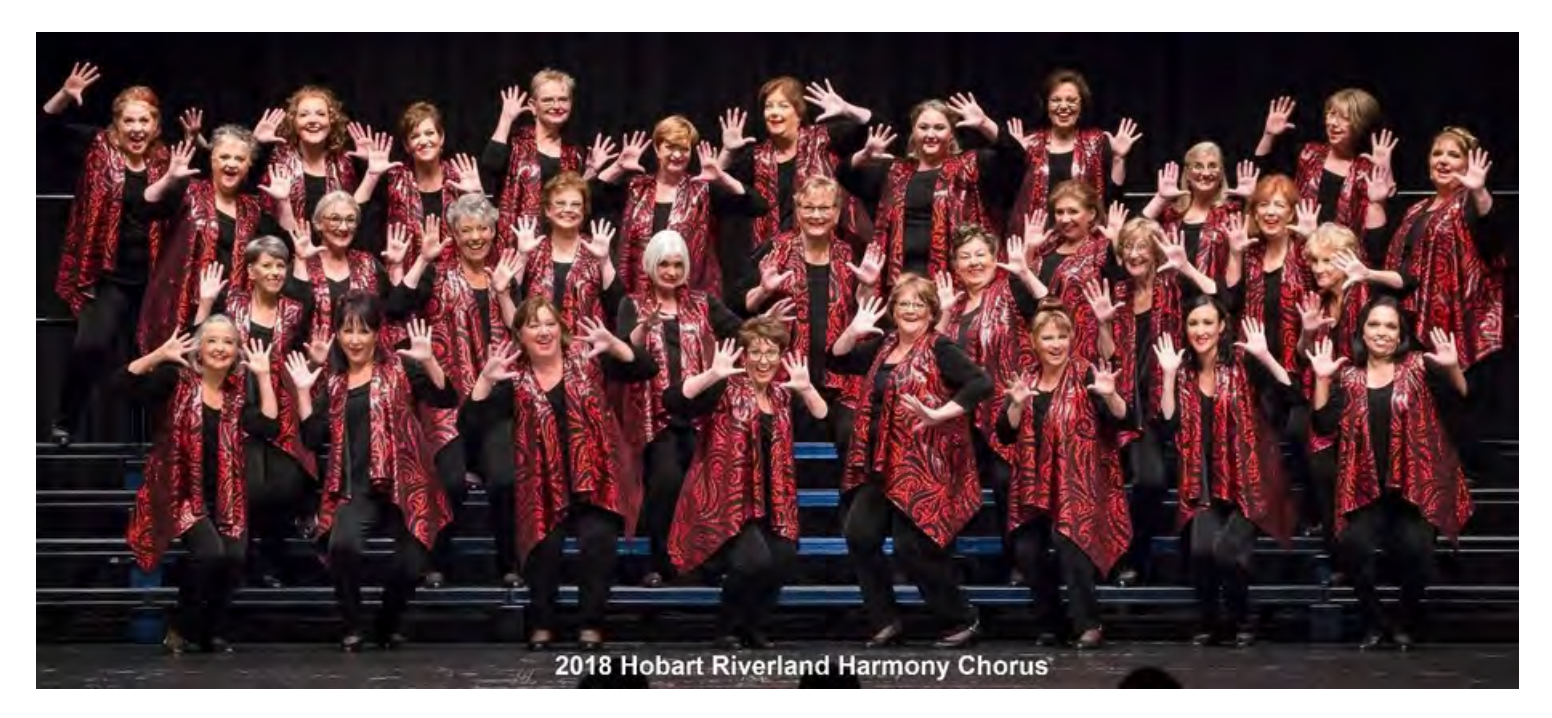
Above: Hobart Convention 2018

So those are some of the highlights for RHC over the past decade. If you really want to know absolutely EVERYTHING that RHC has done in the last ten years, we have a little list!