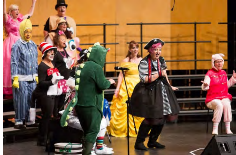
Above: 2017 Perth Package

In 2014 we took to the competition stage again in Sydney. We watched with interest the first of the open chorus contest entries and decided that we would like to work towards that style of competing. In the following years, the chorus reestablished itself, redesigned its logo and culture. We now proudly wear our chorus colours with embroidered vest jackets and short sleeve logo'd tops.