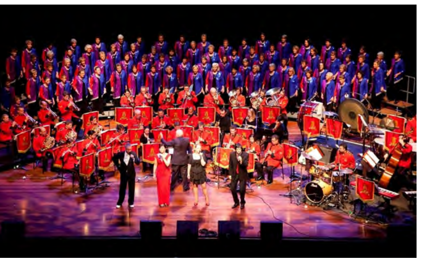
'Above: 'Too Darn Hot' at the Perth Concert Hall

We began the decade with several major shows including 'Barbershop Blitz', 'Bling it on!' and 'Too Darn Hot'.