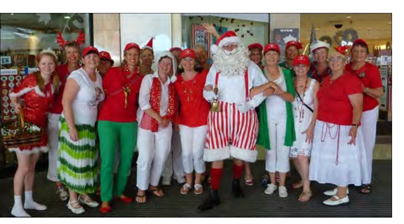
Right: ACW celebrating Christmas – any combination of white, red and green will do, with lots of bling!

Included in these goals were celebrating diversity, being a caring chorus family and to ALWAYS have fun.