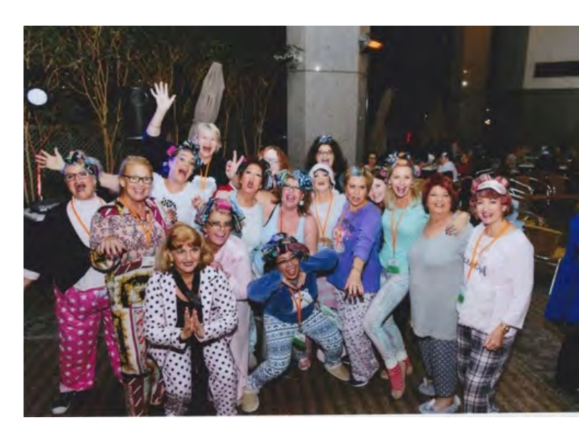
Above: Perth Convention 2017 Pyjama Party Afterglow

Based at Griffith University campus on Queensland's Gold Coast, Coastal Charisma partners with The Blenders to host "SingGC", four free weekly singing classes that promote the benefits of personal development and community engagement through chorus vocal performance.