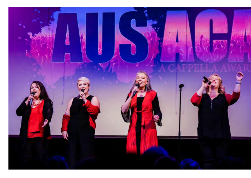
Above: Performing at the Australian A Cappella Awards

We had already surpassed our goals for the year when our friends Hi-Jinx Quartet contacted us. They were not going to go to International Convention in October, so would we like to consider going as the representative for the Region? Would we ever! It was an easy choice because we were all already going with Brindabella to compete in the Harmony Classic. It was a wonderful (if quite frantic) experience to go to International with both our chorus and quartet – a first for both groups. And it was such a confidence boost to head onto the quartet stage with our first place Harmony Classic medals hidden under our costumes.