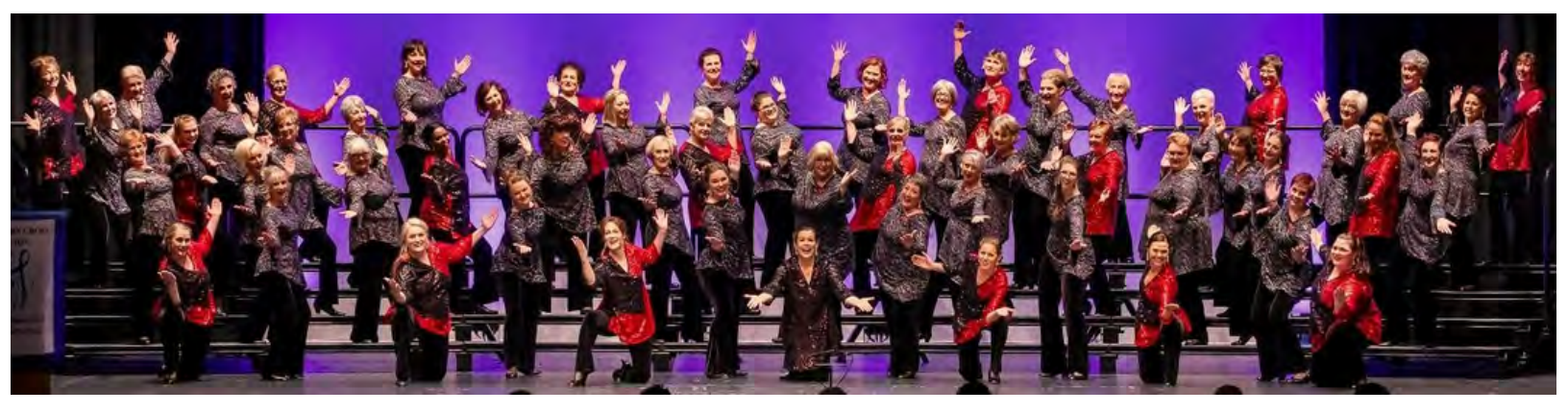
Above: Hobart Convention 2019

These are exciting times for us, and while some things have grown and changed over the 10 years, the sense of belonging and shared passion remains a strong and key factor at Hobart Harmony.