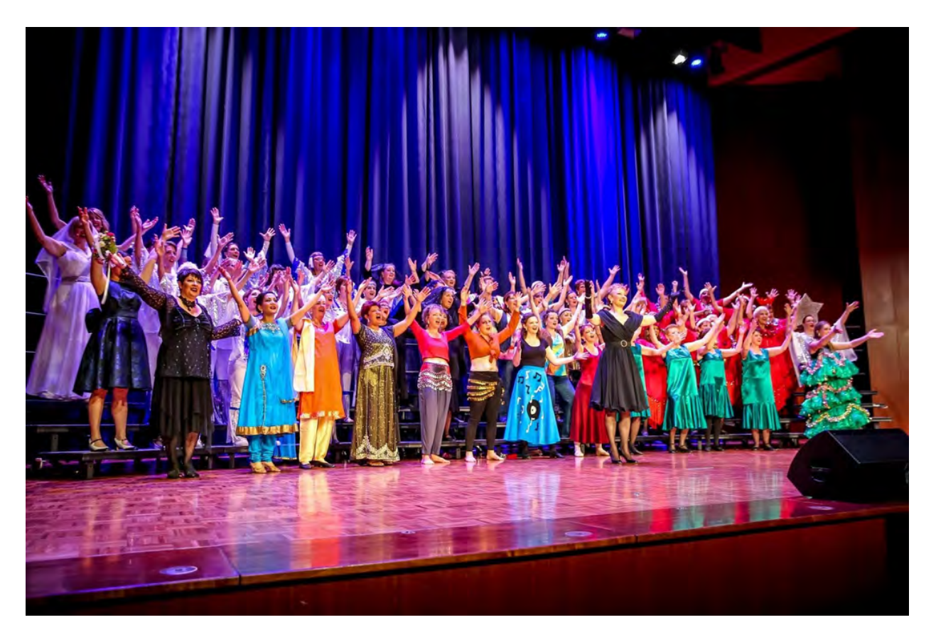
Above: "Say Yes to the Stress!" - finale

It is with joy, that we wish Sweet Adelines Australia Happy 30th Anniversary. Thank you for your support and vision over the years and we look forward to continuing being members of such a progressive and vibrant region.